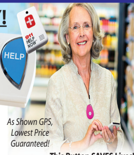
This Button SAVES Lives!